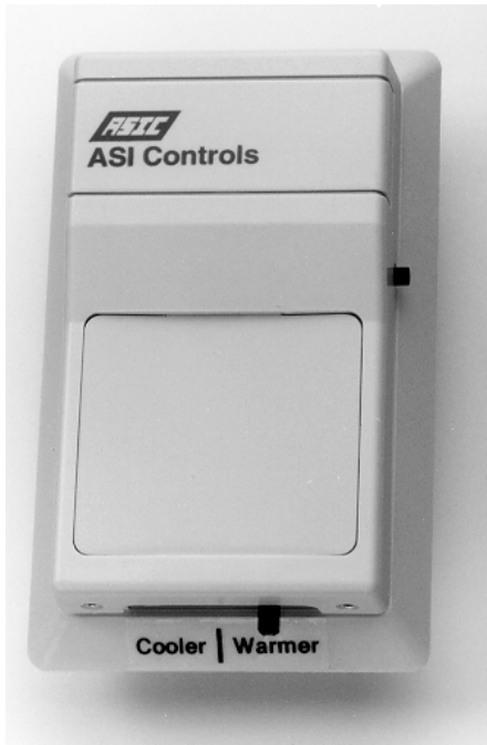
WS-RSO Wall Sensor